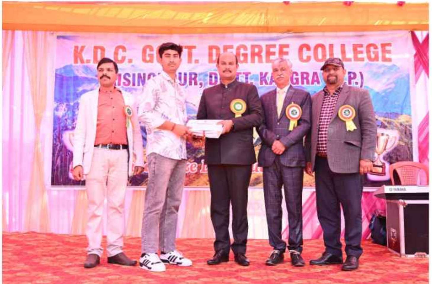
ROVER AND RANGER UNIT OF COLLEGE DURING 5 DAYS CAMP AT REWALSAR

Disclaimer: Admissions in BCA and PGDCA are subject to final affiliation of the courses with the HP University Shimla, for which we have already applied and expecting approval in the coming few days. The final number of seats in different categories will also be known at that time. For any update, please keep looking on the college website. The college reserves the right to make any changes and corrections in the content of this document if and when required without any notice.