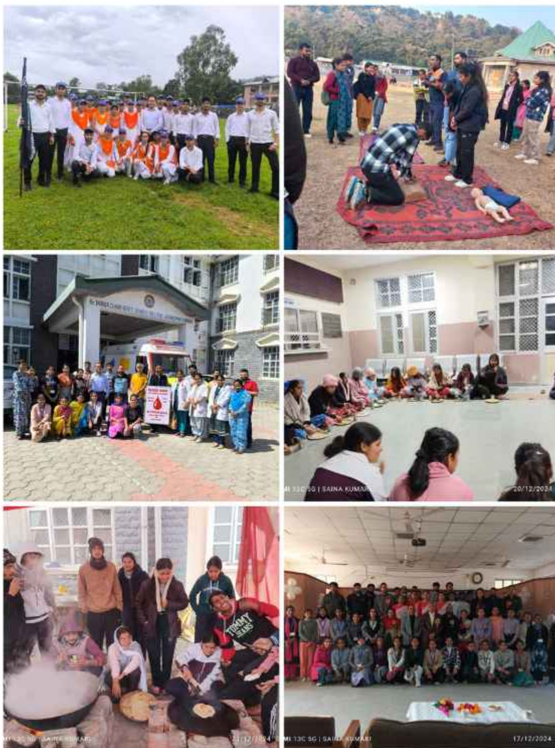
NSS students during 7 days camp