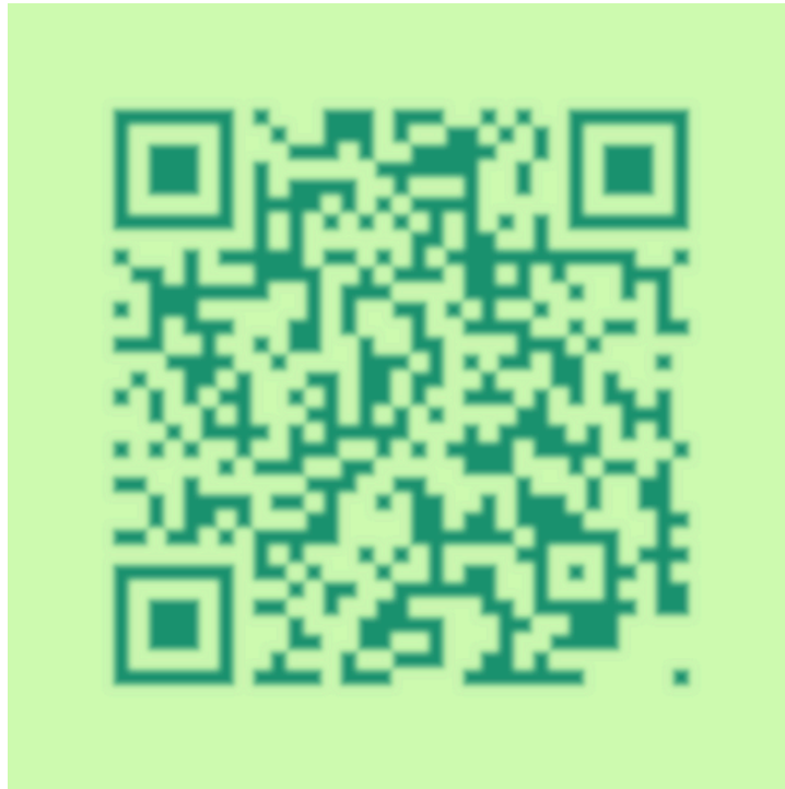
QR Code (College Youtube Channel)