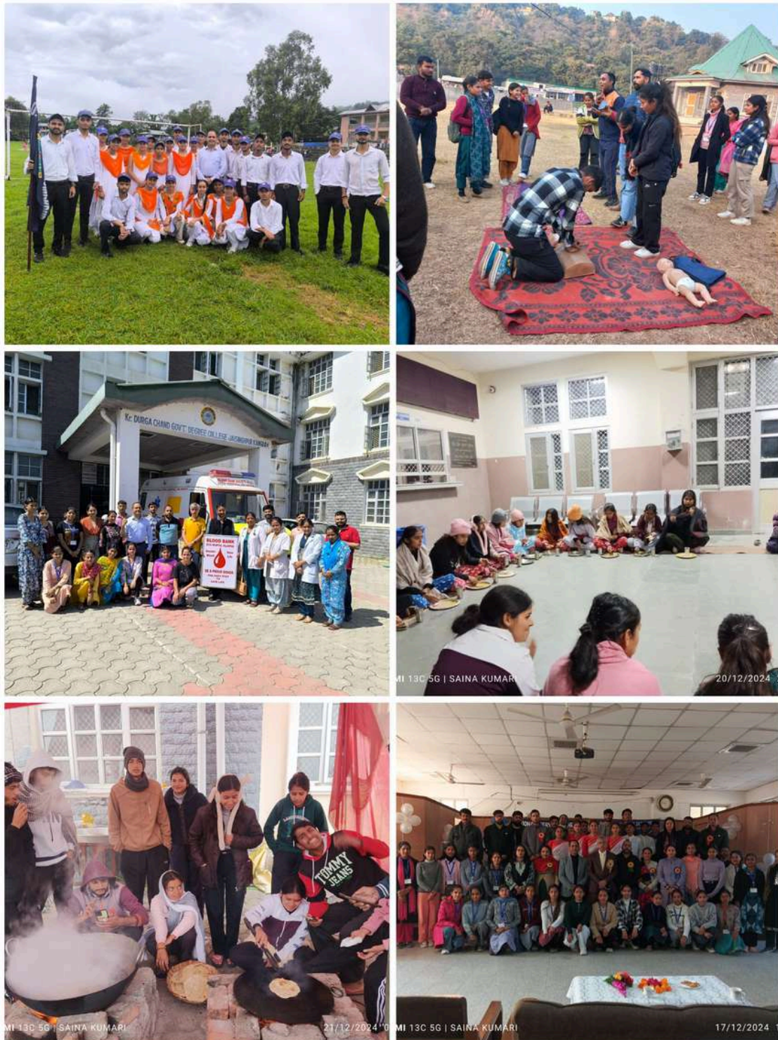
NSS students during 7 days camp

The Himachal Pradesh University has allowed one NSS Units to the College with a strength of 100 students. By joining NSS, the volunteers are given an additional weightage of 2% or 5% preference in matters of admission by various institutions and universities in India.